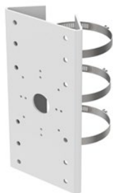
Vertical Pole Mount